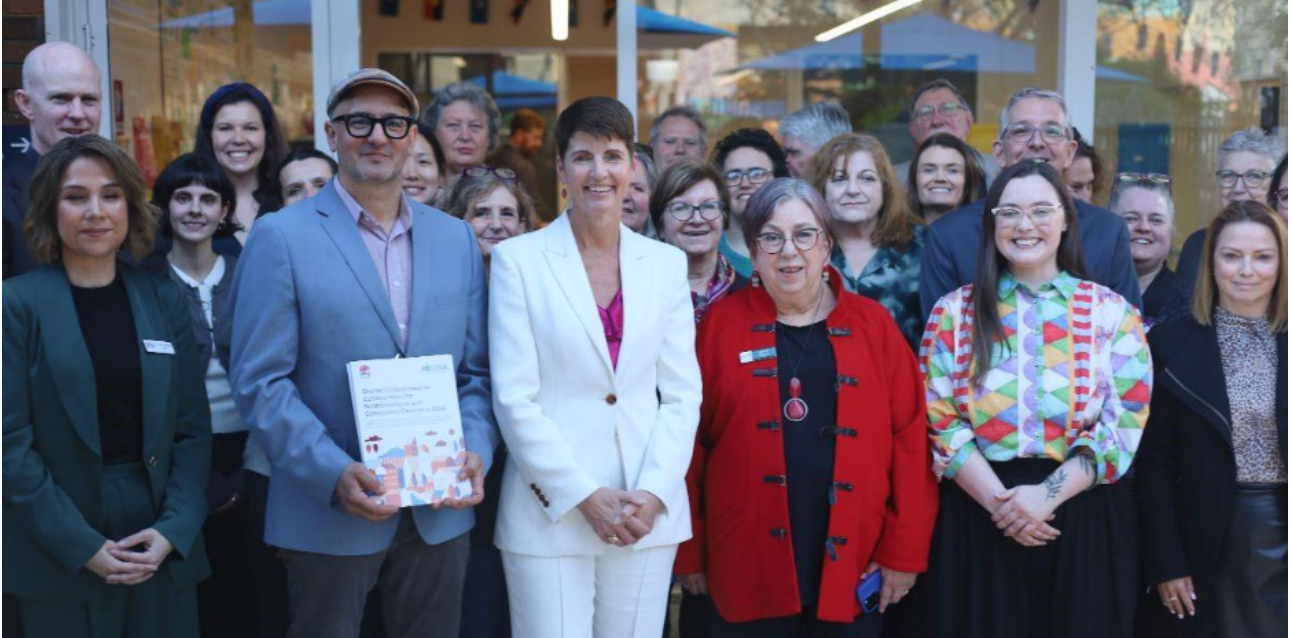
[LCS/DCJ 'Shared Commitment' Launch]

It's important to stay up to date on what's happening in our sector and what other services in the area are up to. It's always great to be able to attend meetings and interagency, and arrange service visits, to help us collaborate to deliver the best possible support to our community.