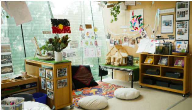
Surry Hills Neighbourhood Centre Long Day Care in Surry Hills, NSW 2010 | CareforKids.com.au